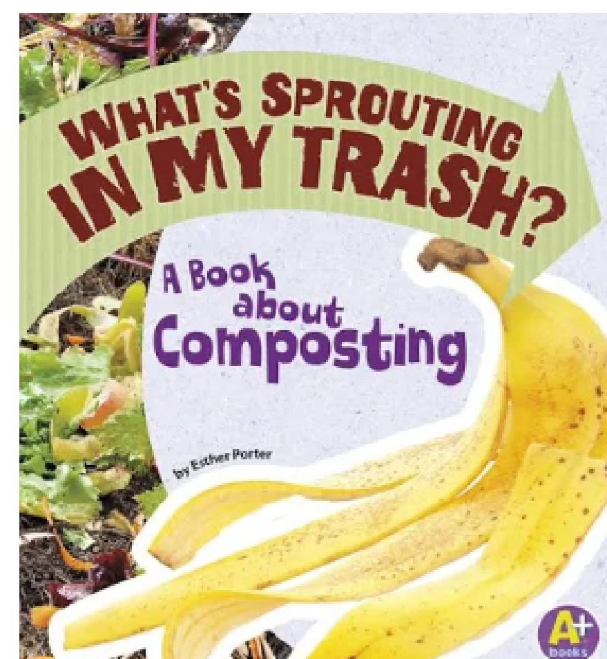
A Book about Composting By Esther Porter

If you enjoyed this project, visit 4-h.extension.uconn.edu to learn more about UConn 4-H. Check out the UConn 4-H webpage to view the videos and resources associated with this program.